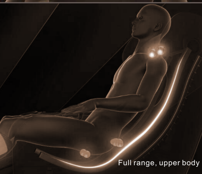
Full range, upper body